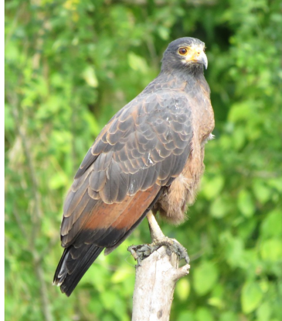
Rufous Crab Hawk

This morning we'll leave our hotel at 5:00 AM (having downed a cup or two of caffeine to help us get started!) and heading eastward along the Atlantic, we'll make a few stops to check out the mud flats for Scarlet Ibises as they set out to feed at dawn. We will continue towards the community of Mahaica where we'll take a boat trip along the river. Among our targets will be Guyana's national bird, the bizarre, primitive Hoatzin, which is found in abundance on this river system. We'll also look for a host of other species including the Rufous Crab Hawk (localized), Black-collared Hawk, Black Hawk-Eagle, Long-winged Harrier, Barred Antshrike, Silvered Antbird, Striped Cuckoo, Little Cuckoo, Green-tailed Jacamar, Golden-spangled Piculet, Mangrove Rail, and Mangrove Cuckoo.