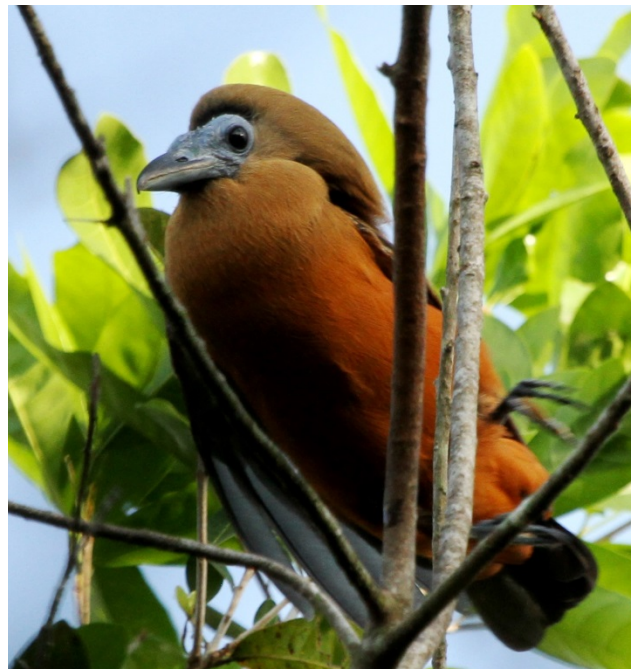
Capuchinbird in full Leking display

Don't be surprised if you are awakened by the dawn calls of Spectacled Owl or Slaty-backed Forest-Falcon. Afterward, we will bird the trails around the lodge and visit a nearby Capuchinbird lek. To see and hear these strange birds displaying is a truly unique experience. We have had the pleasure of this experience on previous trips. We'll be up early birding the trails and then taking a boat trip on the Essequibo River. Turtle Mountain will be our objective where we will explore the main trail, visit Turtle Pond, and climb to an elevation of about 900 feet for a spectacular view of the forest canopy below. The trail to Turtle Mountain winds its way through beautiful primary forest where Red-and-black Grosbeak, Golden-sided Euphonia, Orange-breasted Falcon, Blue-and-yellow and Scarlet Macaws, Ornate Hawk-Eagle, Cream-colored Woodpecker, Yellow-billed Jacamar, Tiny Tyrant-Manakin, Black-chinned Antbird, Amazonian Antshrike, Ferruginous Antbird, Sunbittern and possibly Brown-bearded Saki Monkey can all be found.