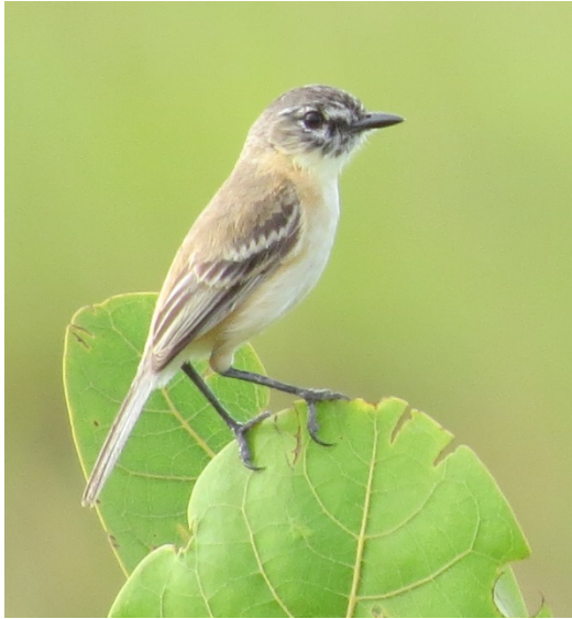
Bearded Tachuri at Caiman house Lodge - Male

remarkable Giant Anteater in habitat that is perfect for it and Savanna Fox.