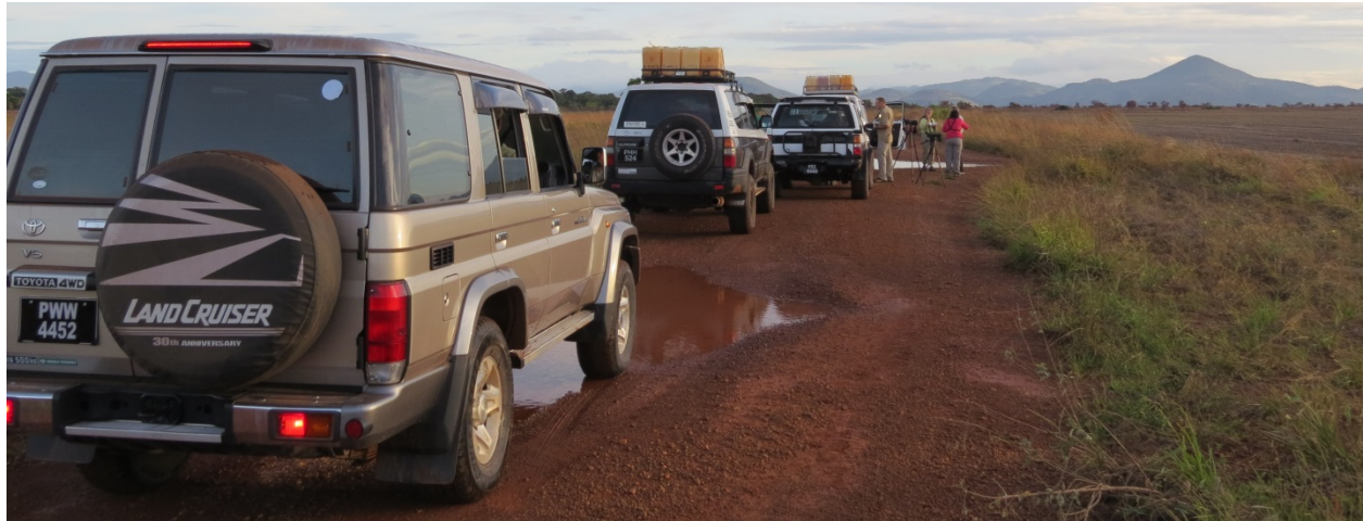
Some of the 4x4 vehicles used on tour for transporting our team

After coffee/tea at our hotel, we will have an early departure in our 4x4 vehicle from Georgetown. The drive from Georgetown to Iwokrama takes about 7 hours on a straight drive; however, this day will be dedicated to birding along the way as the opportunity arises, and we plan to arrive at the river lodge by 6pm. This is catering for the many stops we will make on the way; there are plenty of things to see on the way. We will arrange to take pack breakfast with us and we'll have lunch at 58miles snacket. After we leave the city you will be driving through endless pristine forest, one of the few last remaining un-spoiled Tropical Rainforest in the world. The forest is even more impressive for its remoteness and density and it is most likely