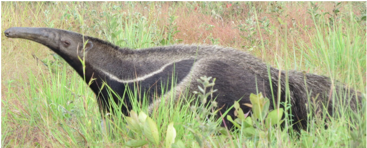
Giant Anteater feeding during the early morning period, this animal is seen regularly on our tours

In addition, we may be lucky enough to see Giant River Otter, Capybara, Black Caiman, Spectacle Caiman and many species of monkeys and even the occasional Emerald Tree Boa and Amazonian Tree Boa as they come out to feed just as it gets dark. Our sunset expedition wraps up with a delicious and hearty dinner back at the Caiman House Lodge.