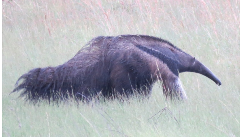
Giant Anteater feeding in the early morning at Kwatata Village

Today, our journey will take us across the Northern Rupununi Savannah. The road we'll follow skirts numerous gallery forests and wetlands offering great views of a variety of herons, ducks, Jabiru, possibly Pinnated Bittern, Great-billed Seed-Finch, Bicolored Wren, Gray Seedeater,