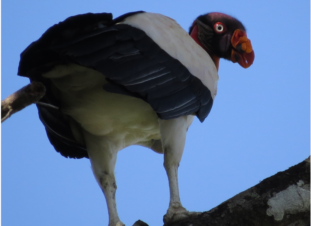
King Vulture – usually seen along the roads and rivers

that we'll be one of the few vehicles traversing this dirt road to get to our destination. On past trips we have seen Orange-breasted Falcon, Grey-winged Trumpeter, Red Fan Parrot, Black Curassow, Black Manakin, Pale-bellied Mourner, Black-Headed Antbird, Bronzy and Yellow-billed Jacamar and for mammals, Jaguar, Jaguarondi, and eight species of monkeys including the Golden-handed Tamarind. Iwokrama River Lodge in the heart of Guyana's beautiful rainforest. The impressive surrounding forest protects a unique ecosystem in the heart of the Guianan shield where Amazonian and Guianan flora and fauna form one of the highest species biodiversities in the world. Our very comfortable lodge has modern cabins each with balconies that overlook the beautiful Essequibo River. There will be plenty to look at with Pied Lapwings, Black-collared Swallow and over the river as well as a host of species in the surrounding forest edges. With luck we may come across, Ringed and Waved Woodpeckers, Black-necked and Green Aracaris, Guianan Toucanet, Black Caracara, and possibly Red-rumped Agouti or Wedge-capped Capuchin Monkey. On our arrival at the River lodge, we will do some birding around the environs before dark. Night at Iwokrama River Lodge. (B,L,D)