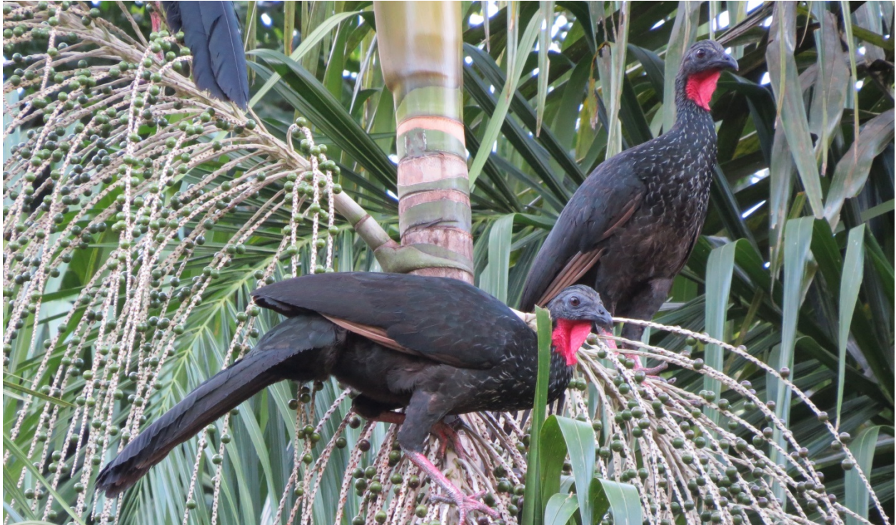
Spix's Guan feeding on Manicole Palm fruits

Today, it will be an early start in 4x4 vehicles for a 30-minute drive to the lek of the Guianan Cock-of-the-Rock where we'll have our second chance to see this beautiful bird. Hopefully having seen the bird well, we will continue to Surama Eco-Lodge, birding on the way. We plan to arrive at the lodge for lunch and a well-deserved cold beer or cold drink of your choice. Birds in the forest on our return walk may include the shy Rufous-winged Ground-Cuckoo and Rufous-throated Antbird. After lunch, we'll bird along the forest edges and visit nearby roosts of a Great Potoo. We may find Grassland Sparrow, Wedge-tailed Grass-Finch, Forest Elaenia, White-throated Toucan, and Fork-tailed Palm-Swift Finch's Euphonia and time permitting we will try for the Ocellated Crake. At dusk, White-tailed Nightjar, Least Nighthawk, Lesser Nighthawk, Tropical and Tawny-bellied Screech-Owls will be quite likely.