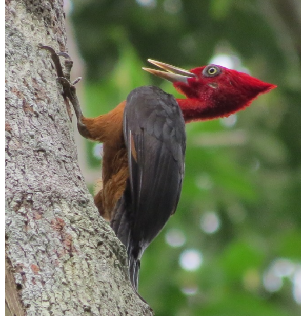
Red-necked Woodpecker

To spend the night at Atta Rainforest Lodge is to spend the night surrounded by pure nature with only the sounds of the forest. At dawn, we will visit the canopy walkway to look for passing flocks of canopy-dwelling species. Time will be spent looking for Todd's Antwren, Spot-tailed Antwren, Short-tailed Pygmy-Tyrant, Guianan Toucanet, Green Aracari, Painted Parakeet, Screaming Piha, Black-headed Parrot, Guianan Puffbird, Dusky Purpletuft, Paradise Tanager, Opal-rumped Tanager, Golden-sided Euphonia, Purple and Green Honeycreepers, Black-faced Dacnis and Black Nunbird. This entire morning will involve birding on the canopy walkway and the trails around the lodge. This wonderful area is famed for its variety of colorful cotingas and if we can locate a few fruiting trees we will be in for an avian spectacle with possibilities of Pompadour, Purple-breasted, and Guianan Red Cotingas, as well as White Bellbird and the outrageous Crimson Fruitcrow. Within the forest that surrounds the lodge, we'll look for Red-legged and Variegated Tinamous, Gray-winged Trumpeter, Cayenne Jay, Amazonian Barred Woodcreeper, Red-billed Woodcreeper, Helmeted Pygmy-Tyrant, Ferruginous-backed Antbird, Waved, Chestnut and Red-necked Woodpeckers, as well as Black Spider Monkey and White-faced Saki Monkey.