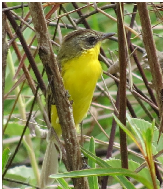
Crested Doradito Caiman House Lodge

This morning, we will start with a cup of Brazilian-style coffee before heading out into the Rupununi Savannah by 4x4. As we move across the savannah, we'll scan the vast wetland areas for the sought-after Bearded Tachuri plus Sharp-tailed Ibis, Yellowish Pipit, Pinnated Bittern, Brazilian Teal, White-tailed Goldenthrout, Vermilion Flycatcher, Bicolored Wren, Double-striped Thick-knee, Burrowing Owl and Maguari Stork. We'll also check an area where the rare and localized Crested Doradito was recently discovered. This is also our best chance to see the