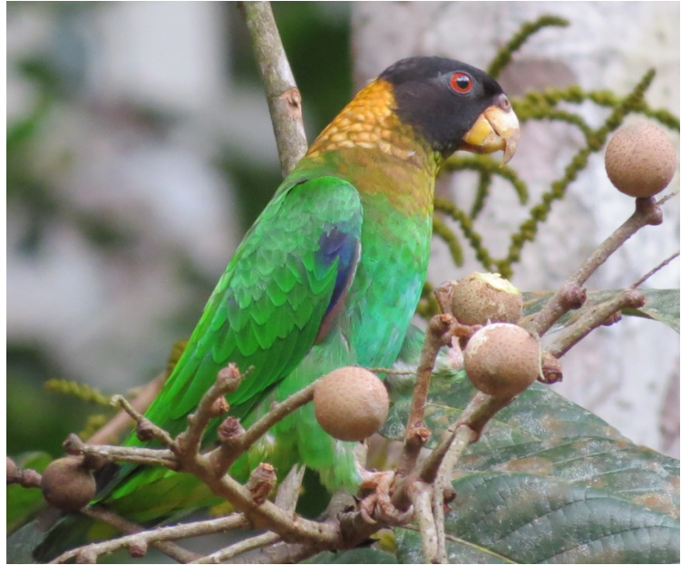
Caica Parrot feeding on fruits

This morning, departing River Lodge after an early breakfast, we'll bird on the road along the way to Atta Lodge. Some forest birds are very elusive and hard to see, including Rufous-winged Ground-Cuckoo, Guianan Shiffornis, Black Curassow, Grey-winged Trumpeter, Black-throated Antshrike, Chestnut-rumped and Long-tailed Woodcreepers, Brown-bellied, Rufous-bellied and Long-winged Antwrens, Fasciated Antshrike, White-throated Toucan, and Golden-collared Woodpecker.